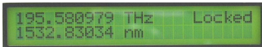
Fig. 7: Front Panel Standard Display

After turning the instrument on and entering the user password, the Clarity PFR front panel display appears as shown in figure 7.