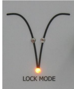
Fig. 6: Sample Lock Mode display reporting Center Lock (Reference Mode)

The Clarity has two possible lock modes: Center and Side. Center refers to the peak (center) absorption wavelength for the gas line referenced by the particular Clarity model (for example, the PFR-1530 locks to the acetylene P9 line at 1530.37095 nm or 195.895288 THz). This is used in Reference Mode. Side refers to the left side of the peak absorption wavelength. In the case of the NLL this mode is the Line Narrowed Mode which the linewidth of the laser is further improved. The front panel Lock Mode display reports the lock mode by illuminating one of the LEDs (Fig. 6). The front panel display screen updates to the correct wavelength and frequency for each mode. Note that changing between modes induces a self-calibration.