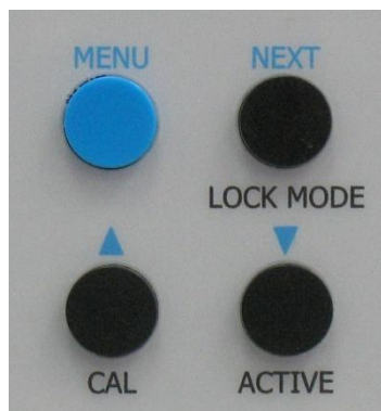
Fig. 1: Front panel button display

Figure 1 below illustrates the front panel buttons used to operate the Clarity.